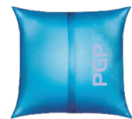
CSPP 500 ml